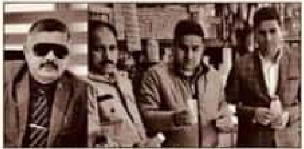
Officials of FCS&CA and Legal Metrology during the drive at Katra.

In this connection, a joint team of FCS&CA and Legal Metrology was