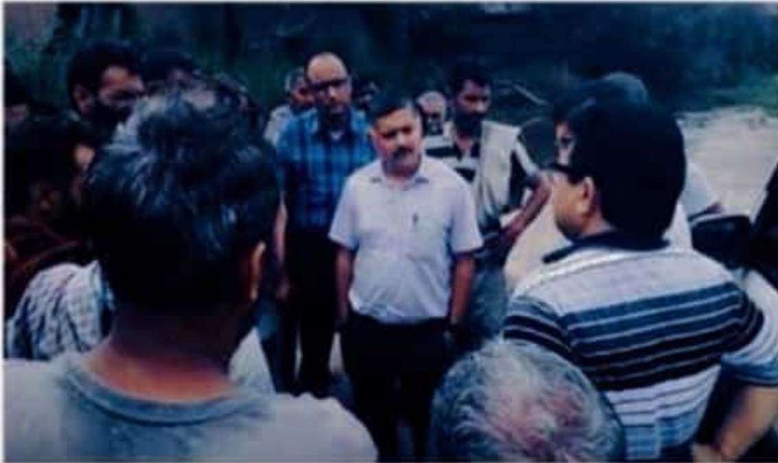
Director FCS&CA along with other officials inspecting Jammu Central store on Saturday